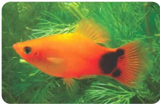
Orange Mickey Mouse Platy Fish

And so we have a fish tank in our living room, okay, and that's all the pets that we give our children, house fish, you have pet fishies! And, like, that's like the degree in which we can take care, so we have fish and little did I know, we went to PetSmart a long time ago when we got these fish and we got these little orange fishies and they had like a little Mickey Mouse kind of outline ears to their tails and we thought that was cute, so we got a couple of those. The PetSmart employee didn't tell me that there was guys and girls to that order because now we have like thousands of these orange fishes, I mean, like every day there's like a bunch of little orange baby fishes and I'm like, "Oh, you guys just gotta stop!" [LAUGHTER] So on a completely side note, if you ever want fish we're like a PetSmart 2.0, we'll just kind of give you fish. [LAUGHTER] So anyway, the fish is, yeah, this is true, unfortunately, so the tank is just filled with all these orange fishes. Right?