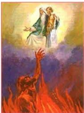
The Rich Man and Lazarus

Luke Chapter 16 has a great story in it, it's a scary one, Jesus is telling it. So you've got a guy who dies and he didn't know God and he ends up tormented, and he calls out to Father Abraham and he wants him